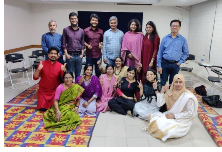
ARC partners attending the introductory convening with GFC staff in Dhaka, Bangladesh.

With seed funding from We Trust Foundation, the primary objective of the ARC Initiative is to address the root causes of exploitation — especially those that affect children and youth — throughout five South Asia countries: India, Bangladesh, Nepal, Pakistan, and Sri Lanka.