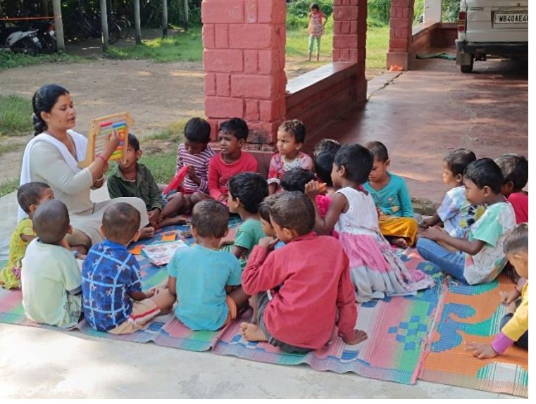
A group of children engaged in a learning activity.

Strengthening networks for advocacy and learning so that community-based organizations can connect, exchange learnings, and share innovations.