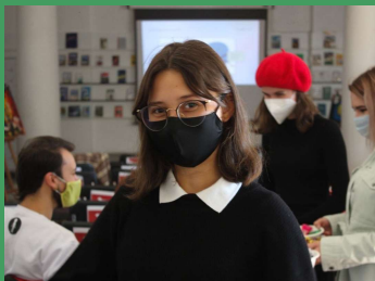
A young person participating in Spark Fund partner Feminismd's event in Moldova.

The Spark Fund is experimenting with digital technology to make the grantmaking process more inclusive and efficient.