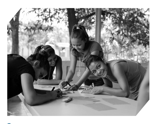
❶ Girls at a MOMUNDH workshop.

Also in 2015, two of our partners in the region received the Global Rising Stars Award, a cash prize that includes capacity-building support to help promising organizations become more sustainable. One of the winners, SAKALA , serves as a safe haven for young people in Haiti's most